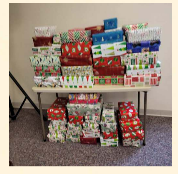
End result: 73 filled and wrapped shoeboxes from November 10th event.